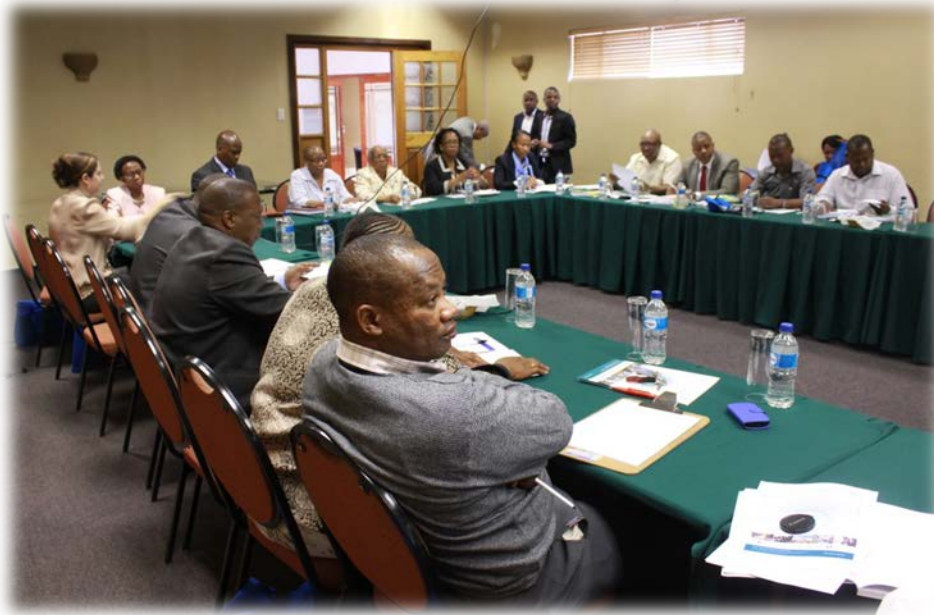
Above and below: Workshop presenter and participants.