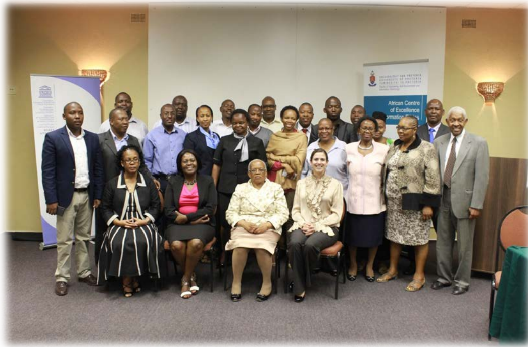
Above and below: Workshop presenter and participants.