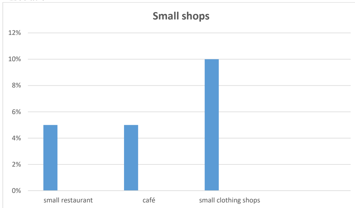
Figure 4.2: Small scale businesses that beneficiaries of Tsoaing Saving Credit Union Association

The findings above are in line with Attan’s (2015) study which revealed credit from micro-finance institution improved standard of living for women from Zabzugu District in Ghana. Attan (2015) in Ghana adds that 64.2% of these women started their enterprises with their own money, and with grit and determination, they were able to obtain the International Monetary Fund (MFI) loans for the expansion of company. They were able to steadily increase their income and support their families financially while also improving their businesses, acquiring assets, providing their families with high-quality health care, ensuring that their children received a good education and being able to pay for household expenses. These underprivileged women have improved their social and financial circumstances, enhancing their standard of living and all-around well-being.