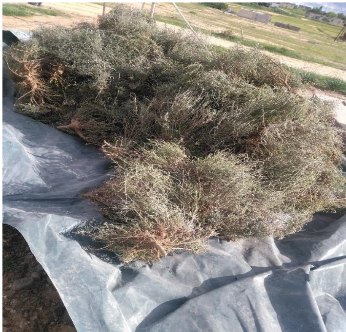
Figure 3: Dried feedstock (Seriphium plumosum) before carbonisation.

A total of 20kg from each of the plant species were collected to carry on the experiment. The uprooted plant material including the roots were chopped into smaller pieces and sun dried for one week. Soil was removed from the dried materials and were further cut to approximately a length less than 20 cm in preparation for the carbonization process.