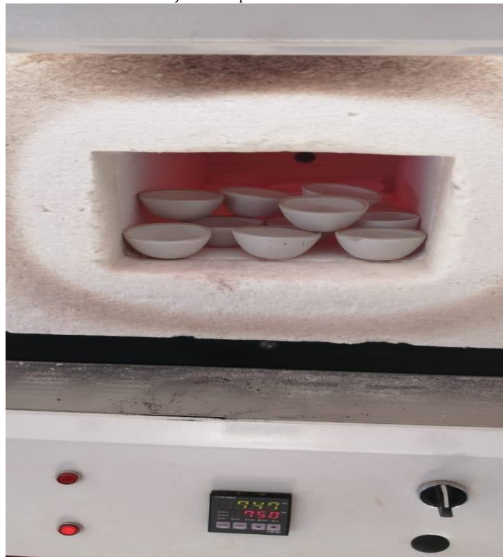
Figure 7: Muffle furnace.