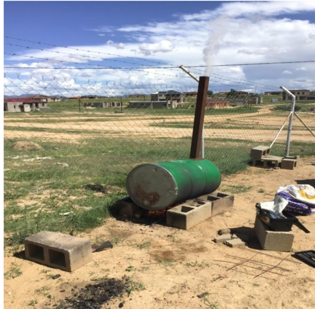
Figure 4: A steel drum (200L) for carbonisation

The dried samples of the IAPs were carbonized using a carbonizer designed by the author. The carbonizer is made of cylindrical 200L oil drum with a chimney at the side for removal of smoke (Fig. 1). The feedstock is a low density biomass, thus the steel drum kiln is the most appropriate as compared to other traditional methods. Biomass was tightly packed into the inner drum and carbonised for 45 minutes (Figure 4).