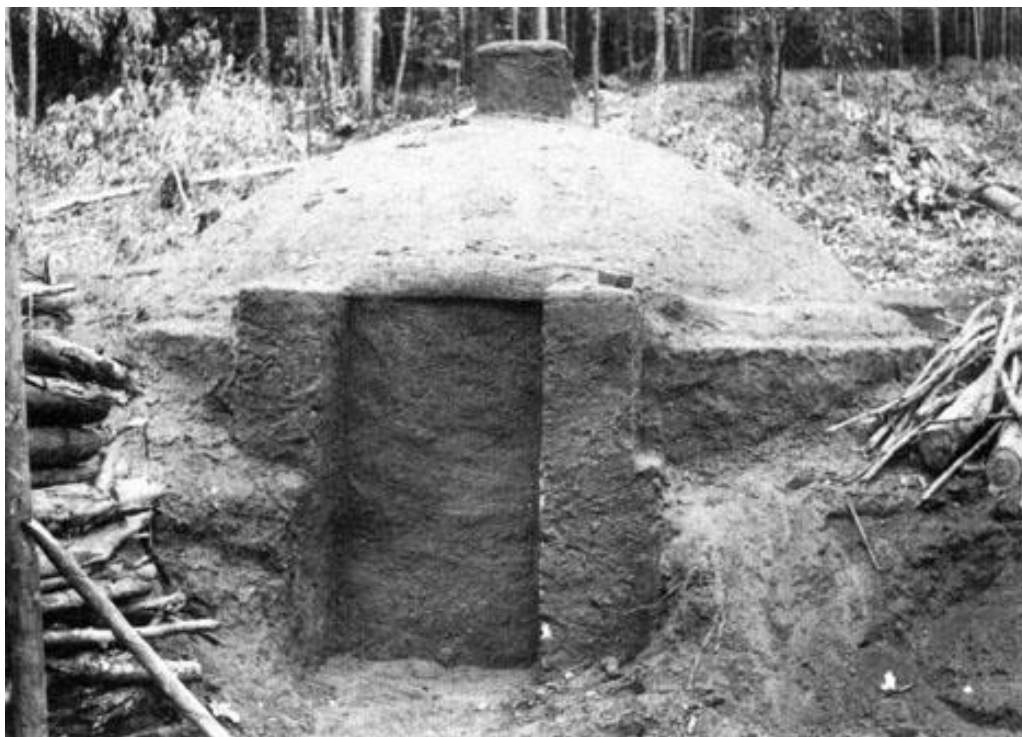
Figure 2: The structure of Earthen Mount Kiln.

Attempts have been done to improve the efficiency of the kilns such as the Casamance kiln which are equipped with a chimney. The purpose of the chimney is to allow a better control of air flow and in the process reducing heat loss during carbonization and improving gas circulation (Adam, 2009). These improvements on the earth kiln (Figure 2) results in giving a higher quality of charcoal.