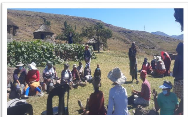
Women Community of Ha Phohla Polihali

Treading further, it was narrated that women in this community have formed community based committees aimed at amassing efforts to protect economic status