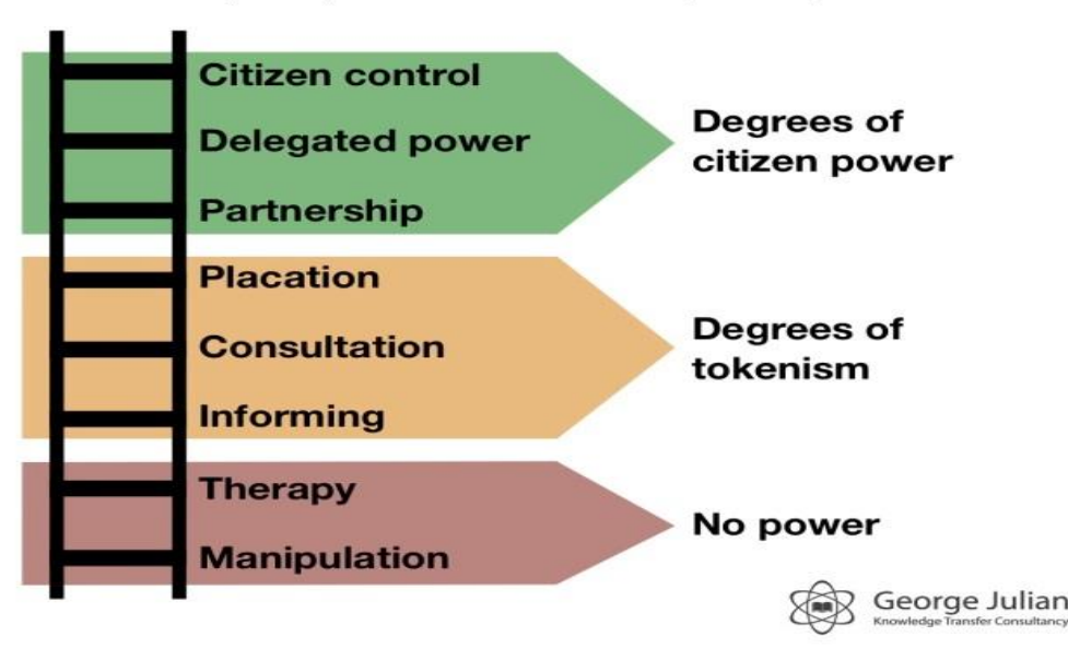
Arnstein (1969) Ladder of citizen participation